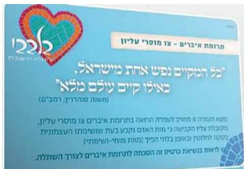
Bilvavi organ donor card 3/11/12